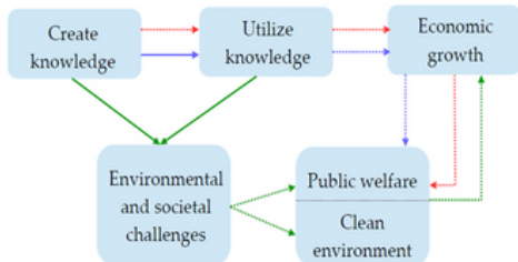
Figure 2. Innovation policy frames in addressing economic, social and environmental challenges

Note: Red colour – first frame, blue – second frame, green – third frame. A solid line – an aspect that has been explicitly addressed by the frame. A dashed line – an aspect that is expected to follow.